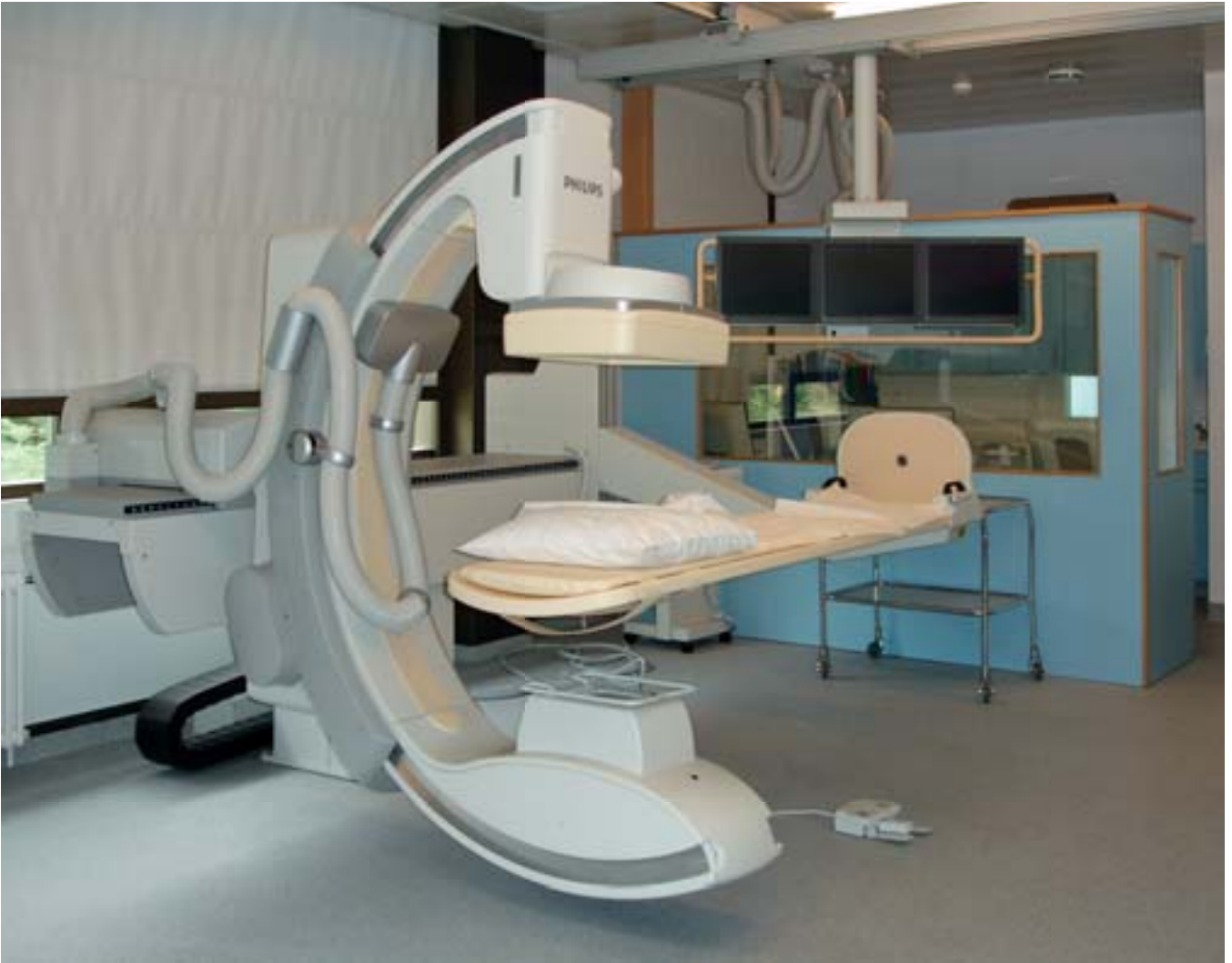
The MultiDiagnost Eleva with Flat Detector in the interventional room

“The 3D-RX confirmed the needle position.”