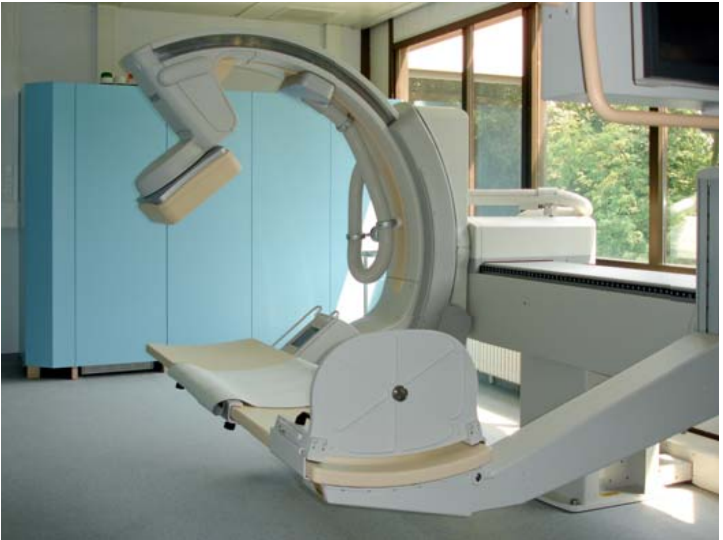
The MultiDiagnost Eleva with Flat Detector in the interventional room