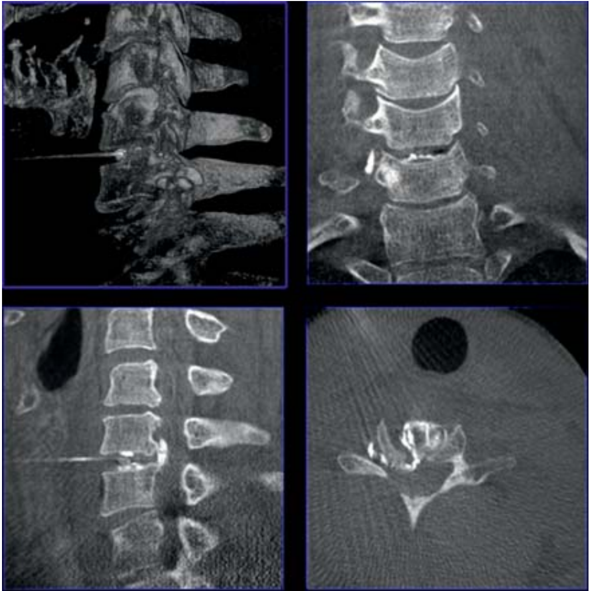
MPR of a discography