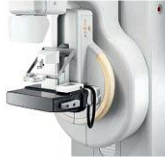
- Advanced Stereo option (8 kg)