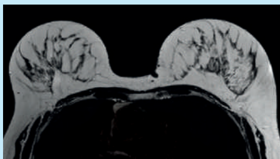
Axial T2w TSE