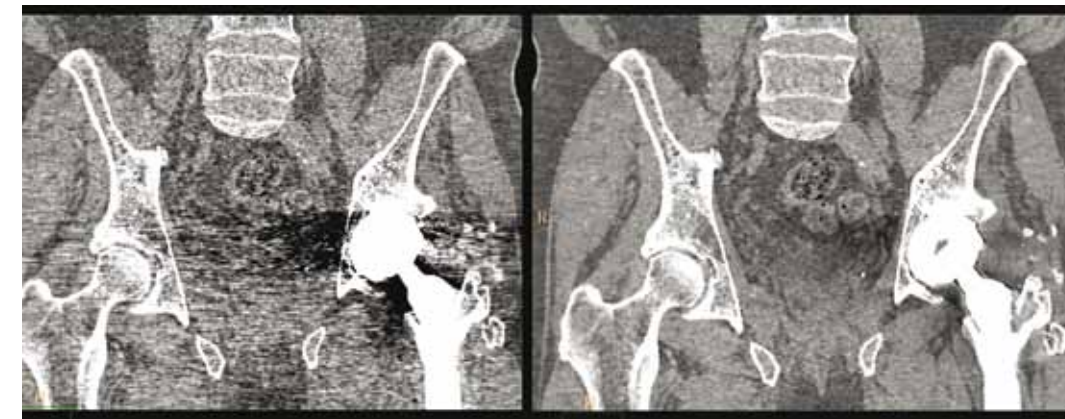
iDose 4 and O-MAR off