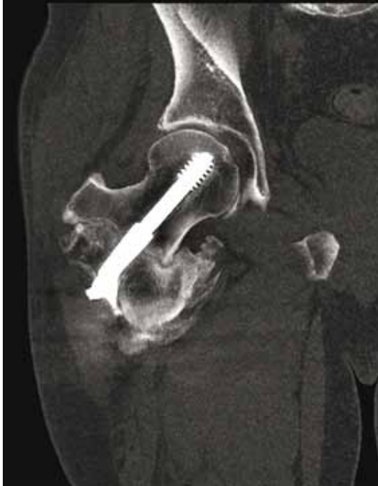
iDose 4 and O-MAR on