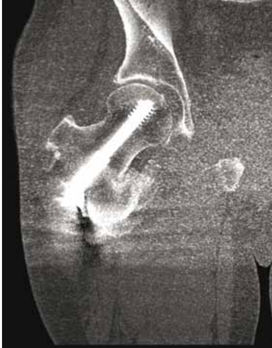
iDose 4 and O-MAR off

Artifacts from large metal objects such as orthopedic implants can be problematic in imaging. These artifacts typically result in loss of anatomical information, impeding visualization of tissue and critical structures. That is why Philips is offering the iDose 4 Premium Package. iDose 4 , Philips' 4 th -generation iterative reconstruction technique improves image quality** through artifact prevention and increased spatial resolution. O-MAR reduces artifacts caused by large orthopedic implants.