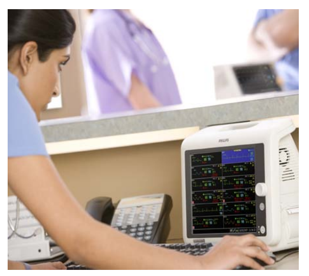
The Philips VSV allows you to check the status of up to 12 patients at a glance.