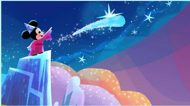
Minnie and Mickey

The Disney themes for Ambient Experience are: