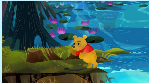
Winnie the Pooh