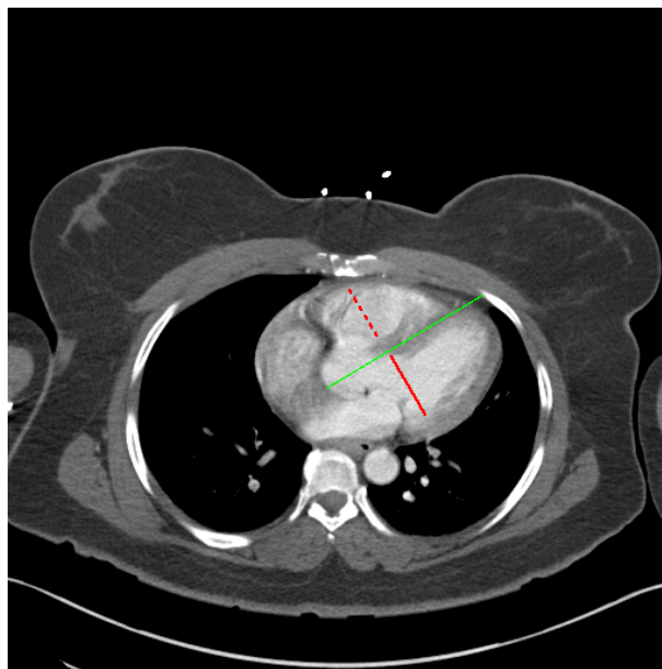
Largest Left Ventricle Diameter Located on Slice 152

— LARGEST VENTRICULAR DIAMETER - - - - - CONTIGUOUS TO LARGEST VENTRICULAR DIAMETER