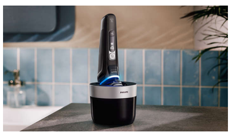
Our cleaning pod is 10 times more effective than water***, thoroughly cleaning and lubricating your shaver in one minute to keep your shaver like new. Compact and cable-free, the pod can be used and stored anywhere.