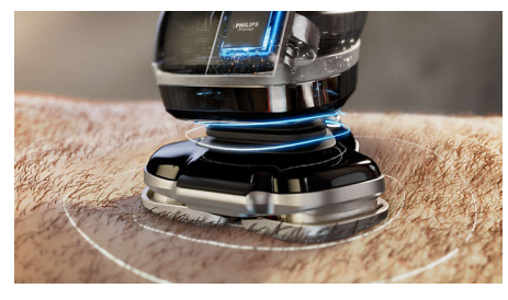
The shaver's intelligent sensor reads hair density 500 times a second and auto-adapts the cutting power for an effortless and gentle shave, even on dense beards.