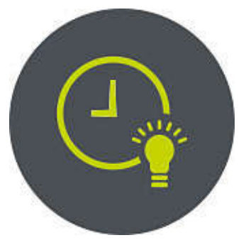
Light modes for multiple needs

The Philips Xperion 6000 UV Pillar is designed to be ready for action. A single charge provides enough energy for a full day's work: up to 10 hours in Eco mode, 4,5 hours in Boost mode, and 12 hours with the torch beam. Powered by a powerful Li-ion battery, the Philips Xperion 6000 UV Pillar can be fully charged within 4,5