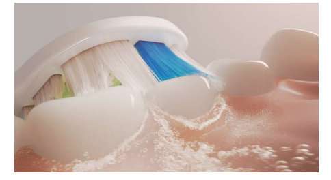
Experience the clean chosen by millions. Philips Sonicare toothbrushes clean gently yet effectively and care for your teeth and gums with

up to 62,000 bristle movements. Dynamic fluid action supports the bristles to clean by driving fluid deep between teeth and along the gumline.