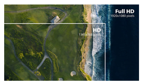
Picture quality matters. Regular displays deliver quality, but you expect more. This display

features enhanced Full HD 1920 x 1080 resolution. With Full HD for crisp detail paired with high brightness, incredible contrast and realistic colours, expect a true-to-life picture.