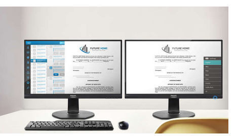
EasyRead mode for a paper-like reading experience