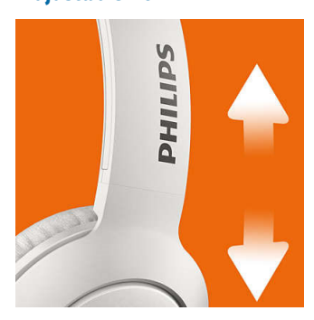
Designed for optimal fit, BASS+ headphones feature swiveling earshells and an adjustable headband to ensure a great fit for all wearers.