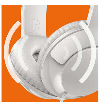
This is big, powerful bass that lets you really feel the beat. Don't let the sleek design fool

you – specially tuned drivers and bass vents produce ultra-low end frequencies to create a unique BASS+ sound signature.