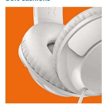
Soft, breathable ear cushions provide great comfort over long listening sessions.