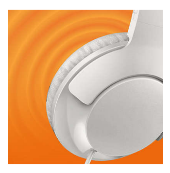
BASS+ headphones feature 32mm speaker drivers that produce big, pumping bass.