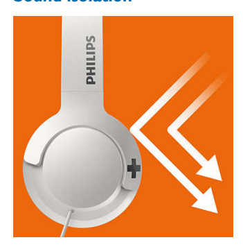
With a closed acoustic design, BASS+ headphones block out ambient noise to create improved sound isolation for a better listening experience.