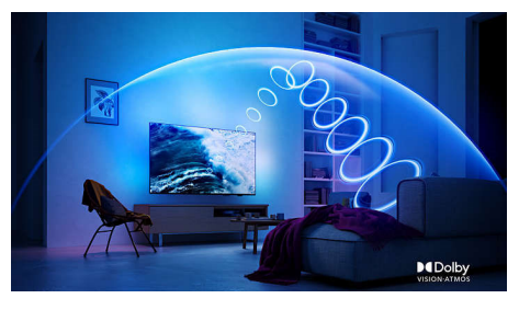
With Dolby Vision and Dolby Atmos on board, your films, shows and games look and sound

incredible. See the picture the director wanted you to see. No more disappointing scenes that are too dark to make out! Hear every word clearly. Experience sound effects like they're really happening around you.