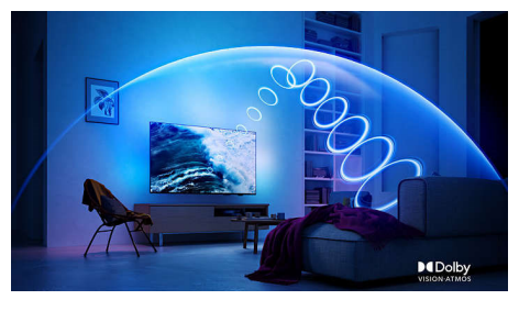
With Dolby Vision and Dolby Atmos on board, your films, shows and games look and sound

incredible. See the picture the director wanted you to see. No more disappointing scenes that are too dark to make out! Hear every word clearly. Experience sound effects like they're really happening around you.