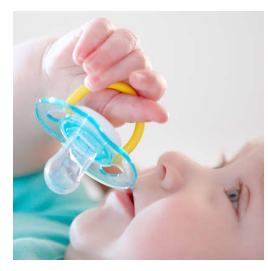
Our security handle lets you easily remove your baby's soother at any time. Even little hands can grab it!