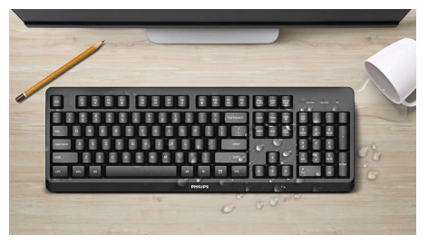
Life can be messy. With this water-resistant keyboard, the occasional spill or spray is no problem. These keyboards are built to last.