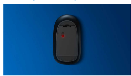
High-definition optical tracking for smooth control