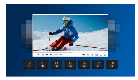
With these multi-media shortcuts, you can easily switch to music, volume or video play by a simple click.