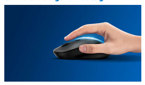
Comfortable ergonomic mouse design feels areat