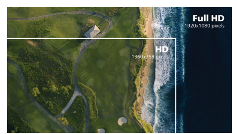
Picture quality matters. Regular displays deliver quality, but you expect more. This display

features enhanced Full HD 1920 x 1080 resolution. With Full HD for crisp detail paired with high brightness, incredible contrast and realistic colors expect a true to life picture.