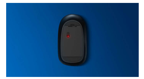
High-definition optical tracking for smooth control