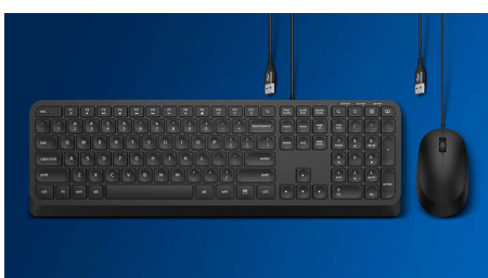
Simple plug-and-play wired USB connections