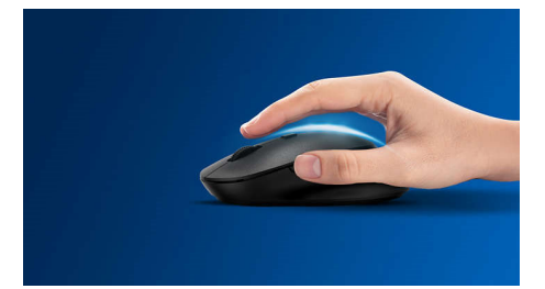
Comfortable ergonomic mouse design feels great