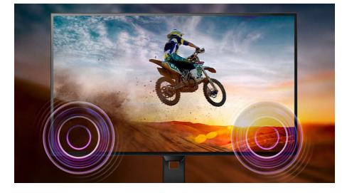
A pair of high quality stereo speakers built into a display device. It can be visible front firing, or invisible down firing, top firing, rear firing, etc depending on model and design.