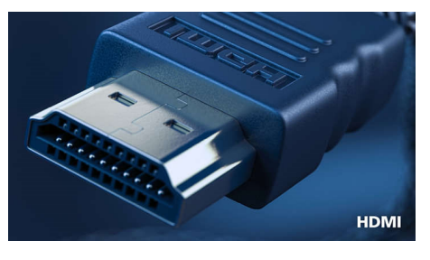
An HDMI-ready device has all the required hardware to accept High-Definition Multimedia Interface (HDMI) input. A HDMI cable enables high-quality digital video and audio all transmitted over a single cable from a PC or any number of AV sources (including set-top boxes, DVD players, A/V receivers and video cameras).