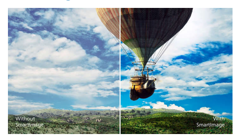
SmartImage is an exclusive leading edge Philips technology that analyzes the content displayed

on your screen and gives you optimized display performance. This user friendly interface allows you to select various modes like Office, Photo, Movie, Game, Economy etc., to fit the application in use. Based on the selection, SmartImage dynamically optimizes the contrast, color saturation and sharpness of images and videos for ultimate display performance. The Economy mode option offers you major power savings. All in real time with the press of a single button!