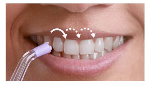
Gentle pulses of water keep you going and guide you from tooth to tooth in Deep Clean mode — so you get it right every time.