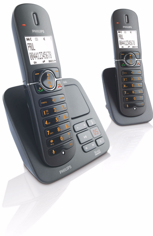
Philips Cordless phone answer machine