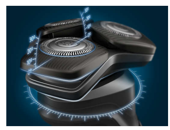
Fully flexible heads turn 360° to follow your facial contours. Experience optimal skin contact for a thorough and comfortable shave.