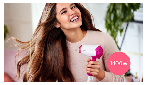
This 1400W hairdryer creates the optimum level of airflow and gentle drying power, for beautiful results every day.