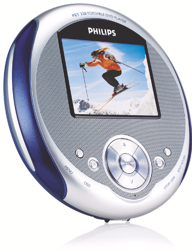
Philips Portable DVD Player