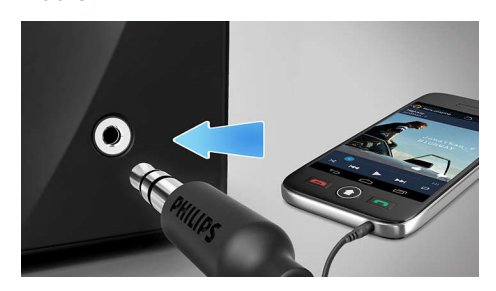
Audio-in for easy connection to almost any electronic device