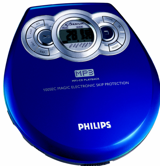
Philips Portable MP3-CD Player