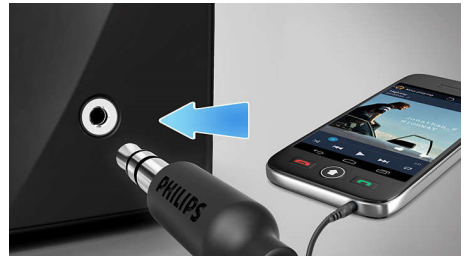
Audio-in for easy connection to almost any electronic device