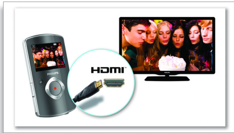
Direct TV connection via HDMI for viewing your videos in HD