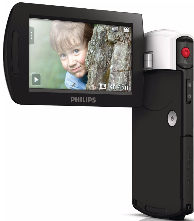
Philips HD camcorder