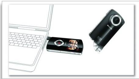
Integrated USB plug for no-fuss connection to your PC/Mac