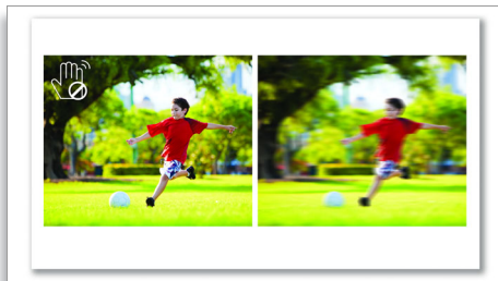
Advanced anti-shake lets you take great videos that you will always be proud to share. Steady and undistorted videos are ensured by gyro sensors that are armed with advanced algorithms. The sensors take measurements of the distance between the ground and the camera lens, and make the necessary

corrections whenever the camcorder wobbles. This advanced technology gives you blur-free pictures every time, letting you capture the best moments in life in amazing videos.