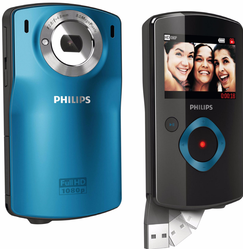
Philips HD camcorder