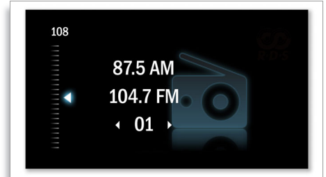
AM/ FM tuner for radio enjoyment