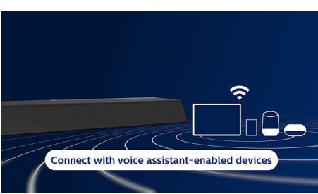
Ask Alexa-enabled devices, or any speaker that works with the Google Assistant, to play music

through the soundbar. Prefer Siri? This soundbar works with Apple AirPlay 2, so you can ask her too. Turn the music up. Skip tracks. All completely hands-free.