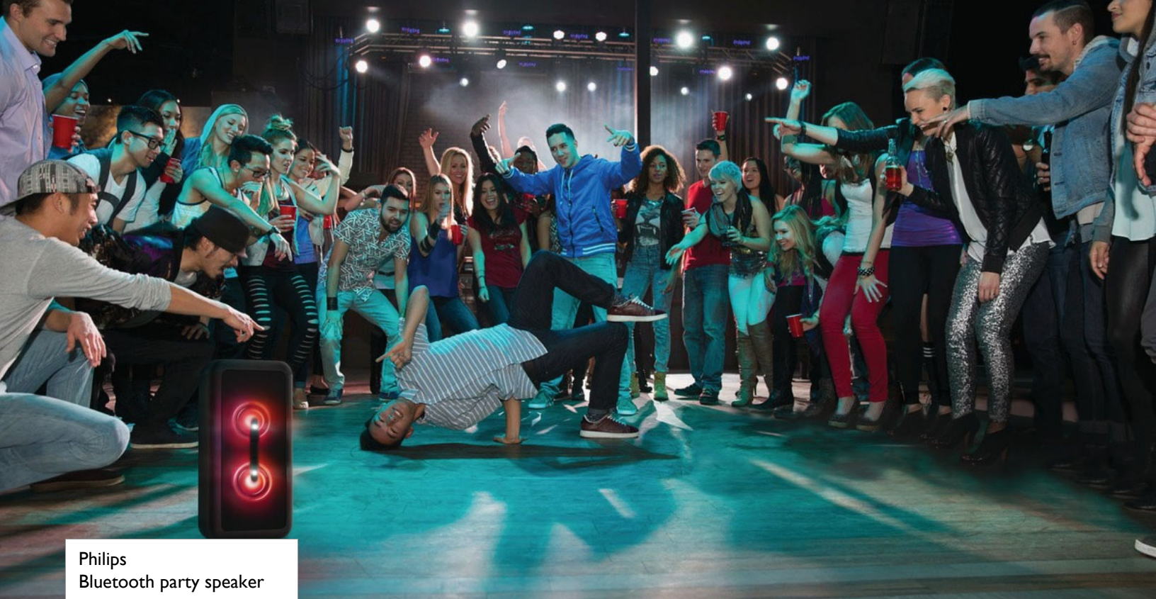
Philips Bluetooth party speaker