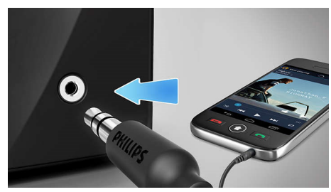
Audio-in for easy connection to almost any electronic device