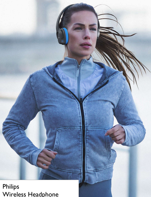
Philips Wireless Headphone

40mm drivers/closed-back Over-ear Sweat/ water proof