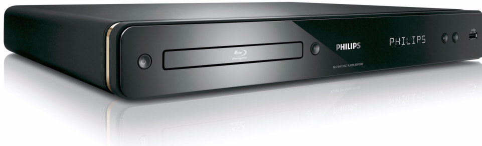
Philips Blu-ray Disc player