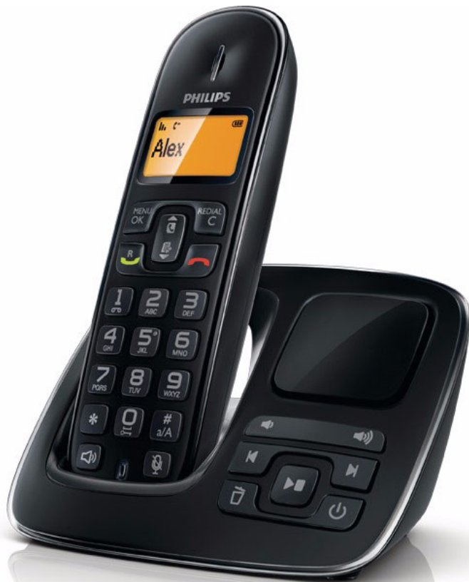
Philips BeNear Cordless phone