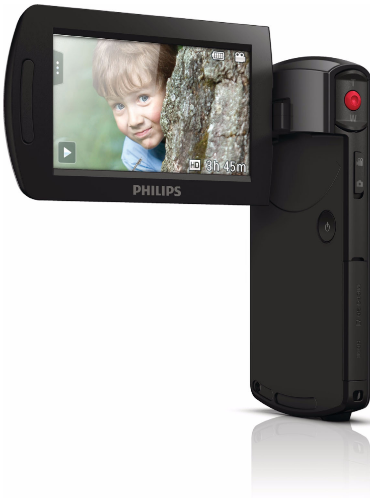
Philips HD camcorder