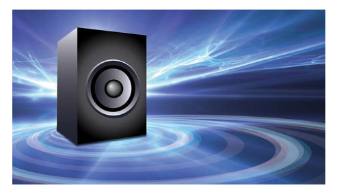
External subwoofer adds thrill to the action