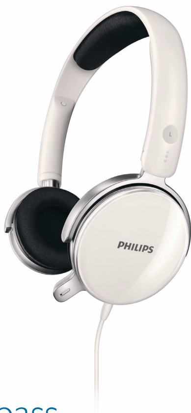
Philips PC Headset