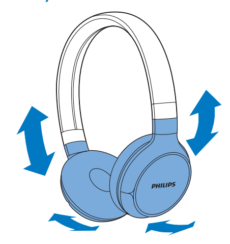
Adjust the headband to fit your head.