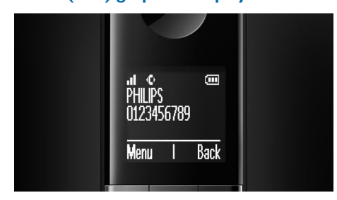
High contrast, 4.6cm (1.8") white on black graphical display