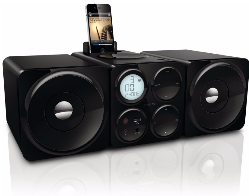
Philips Cube micro sound system