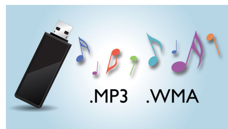
Enjoy MP3/WMA music directly from your portable USB devices