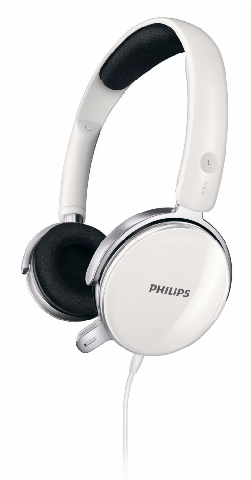
Philips PC Headset