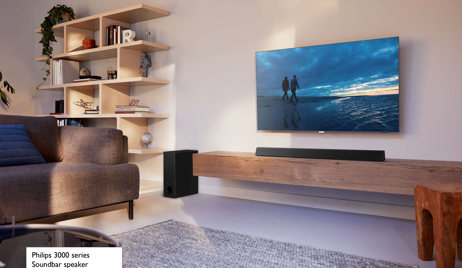
Philips 3000 series Soundbar speaker

3.1 CH wireless subwoofer HDMI ARC & USB Dolby Digital 300W