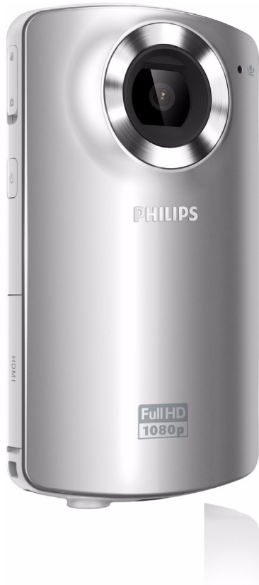
Philips HD camcorder