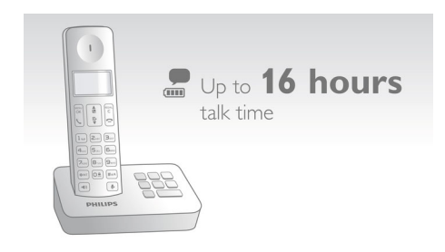
Up to 16 hours of talk time on a single charge