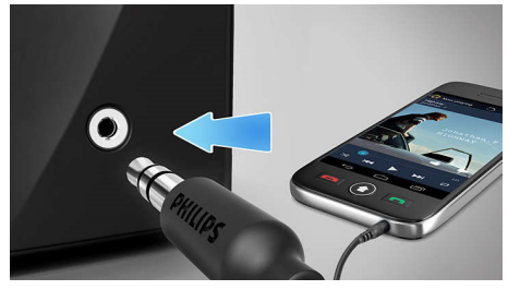
Audio-in for easy connection to almost any electronic device